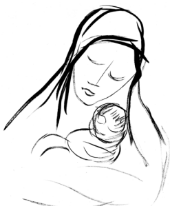
Drawing by Thomas Merton. Used with permission of the Merton Legacy Trust and the Thomas Merton Center at Bellarmine University.

Mother Seton House PO Box 673 Fryeburg, ME 04037